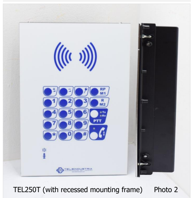
TEL250T (with recessed mounting frame)