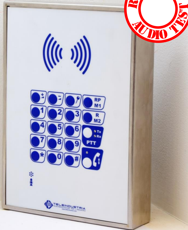
TEL250TP (with surface mounting frame)